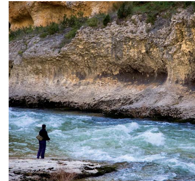
River Irati in the gorge of Lumbier

A few days before, or after, the Pamplona festival in honour of San Fermin, Hemingway took his wife and some friends to enjoy a few days' rest in the Hostal Burguete. The aim of his stay in Auritz/Burguete was to rest, enjoy the landscape and walk to the River Irati to fish a few trout.