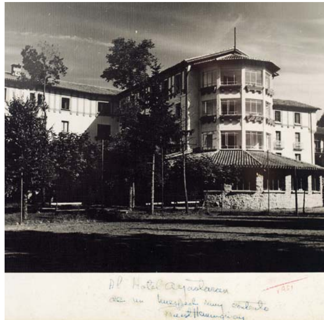
Photo which Hemingway dedicated to the Hotel Ayestarán