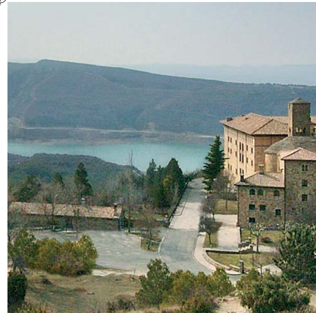
Leire Monastery and Yesa Reservoir

Lekunberri, in a very beautiful natural setting, was the place that the American writer chose to relax, to get away from the crowds and find some peace.