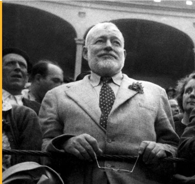
Hemingway in the bullring in Pamplona

Lekunberri Plazaola, 21 31870 Lekunberri Tfno.: 948 50 72 04 Fax: 948 50 73 33 oit.lekunberri@navarra.es