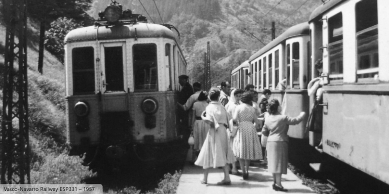
Vasco-Navarro Railway ESP331 – 1957