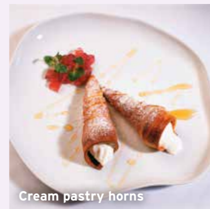
Cream pastry horns

The Pyrenees area has its own specialities: menus based on game or wild mushrooms, trout, tasty steaks, cider, cheese with the Idiazabal Designation of Origin, dairy desserts like traditional cuajada (junket) or cream pastry horns, txantxigorri cakes, fruit such as kiwis or exquisite artisan chocolate, like urraikin eгина in Elizondo.