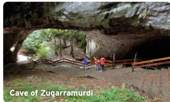
Cave of Zugarramurdi