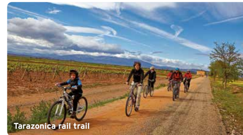
Tarazonica rail trail