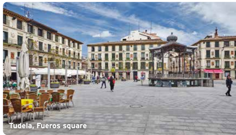
Tudela, Fueros square