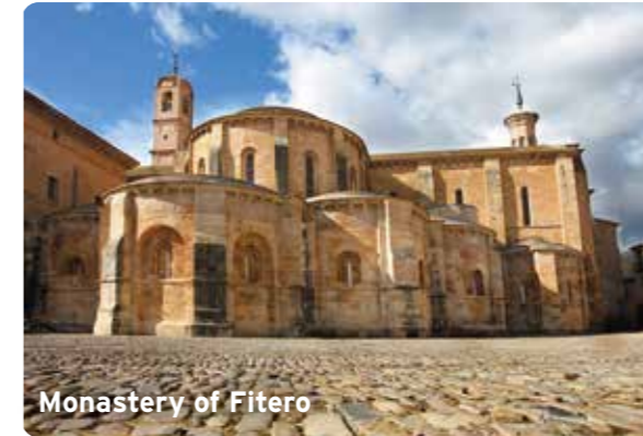
Monastery of Fitero